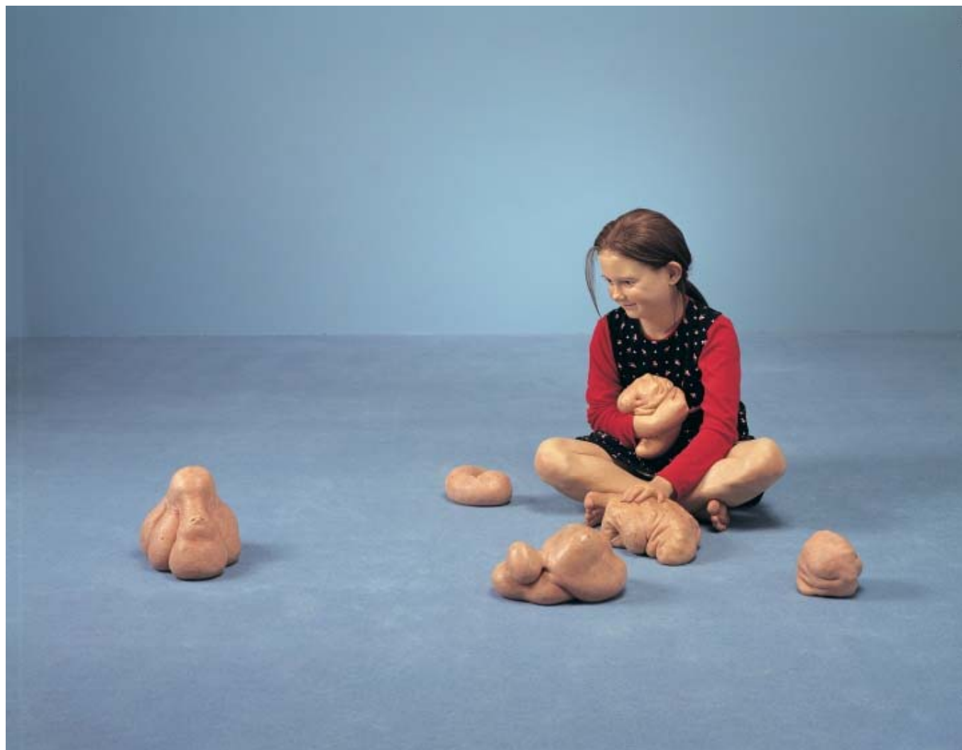
Still Life With Stem Cells