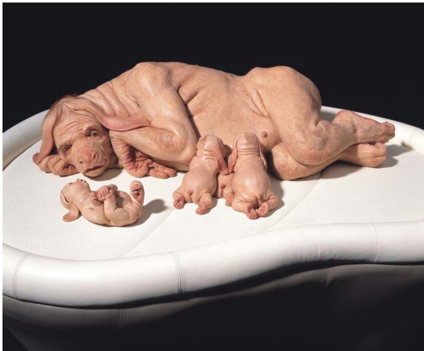
The Young Family