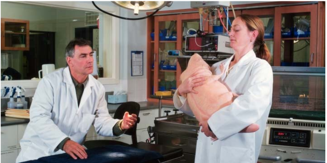
Science Story Part II: Ethical Issues 2001 Digital C-Type photograph 100cm x 200cm

From the start, I knew Piccinini lived and worked in Australia; like me, she is the offspring of white settler colonies, their frontier