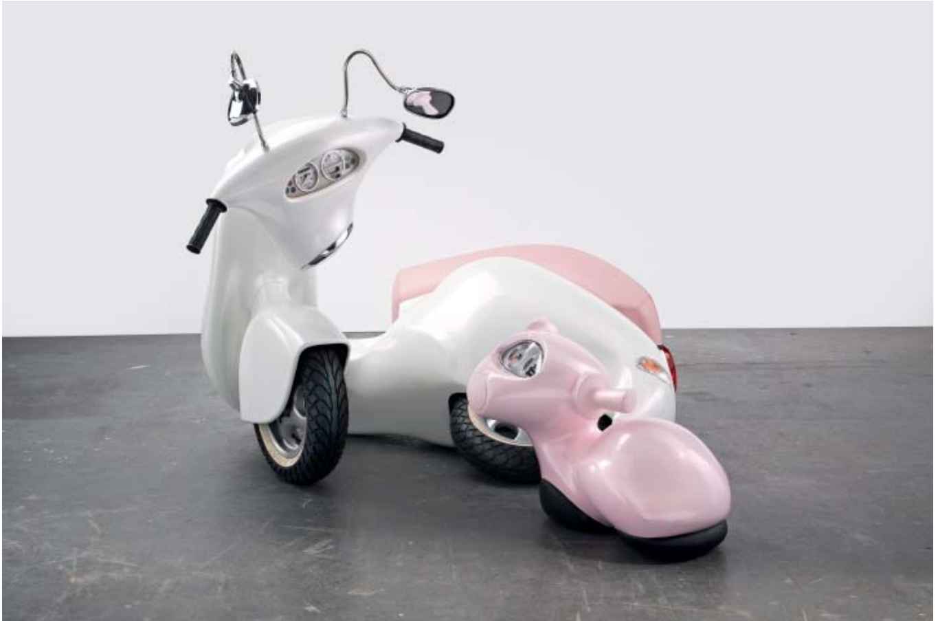
Nest 2006 fibreglass, automotive paint, leather, plastic, metal, rubber, mirror 197 x 186cm x 104cm high (variable)